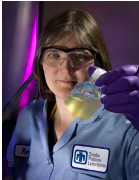
Sandia National Laboratories and General Motors have found that ethanol from plant and forestry biomass could sustainably replace a third of gasoline use by the year 2030 (Wong).