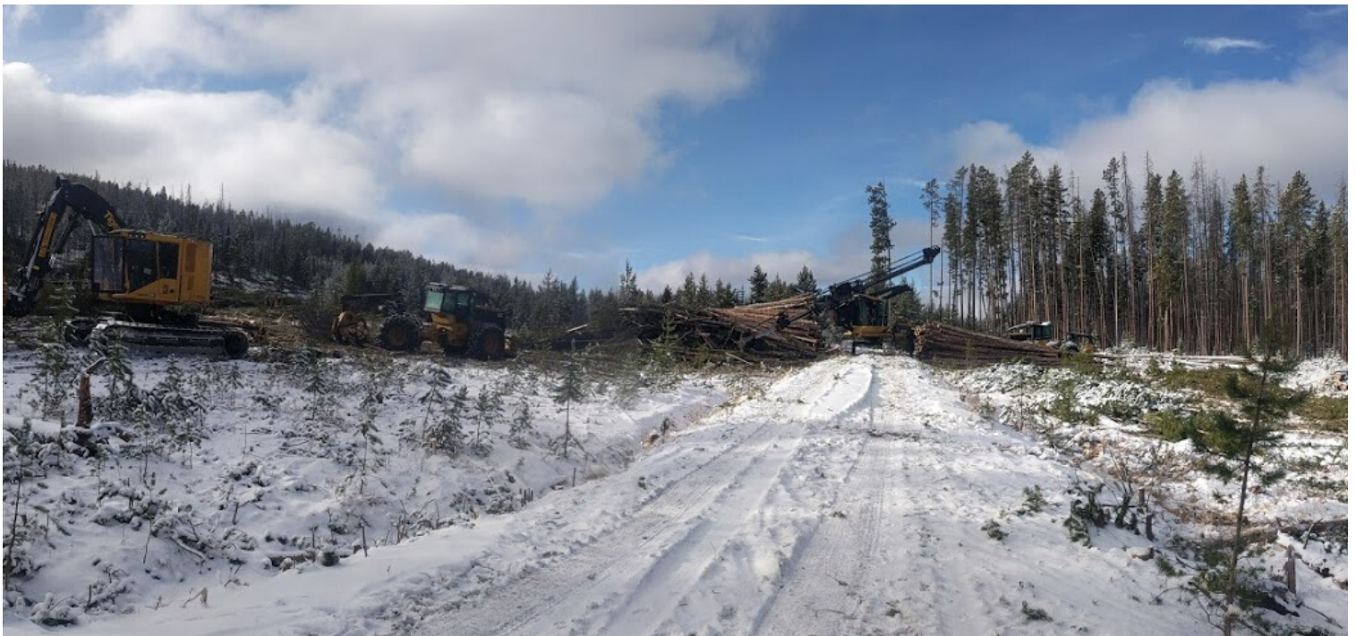
Picture above shows a panorama of the Boulder Lowlands GNA project.

Through GNA, Montana is improving forest health and resiliency, reducing threats to communities and watersheds from large and destructive wildfires, and creating more jobs and local economic benefits.