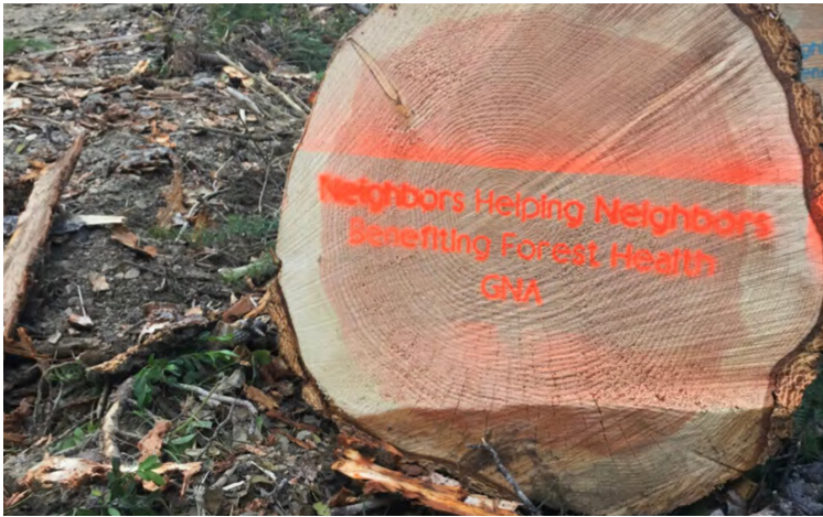
Picture above shows the first haul of timber off the Elk Gem GNA project.

Restoration through GNA occurs across Montana and will increase in scope and scale as revenue from GNA timber sales increase.