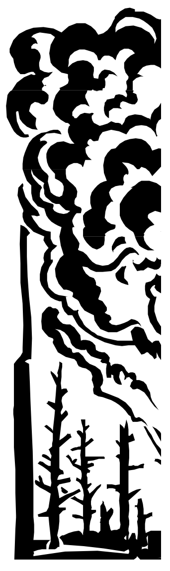
smoldering stages of a fire.

Smoke events often catch us off-guard. This guide is intended to provide local public health officials with the information they need when wildfire smoke is present so they can adequately communicate health risks and precautions to the public. It is the product of a collaborative effort by scientists, air quality specialists and public health professionals from Federal, state and local agencies.