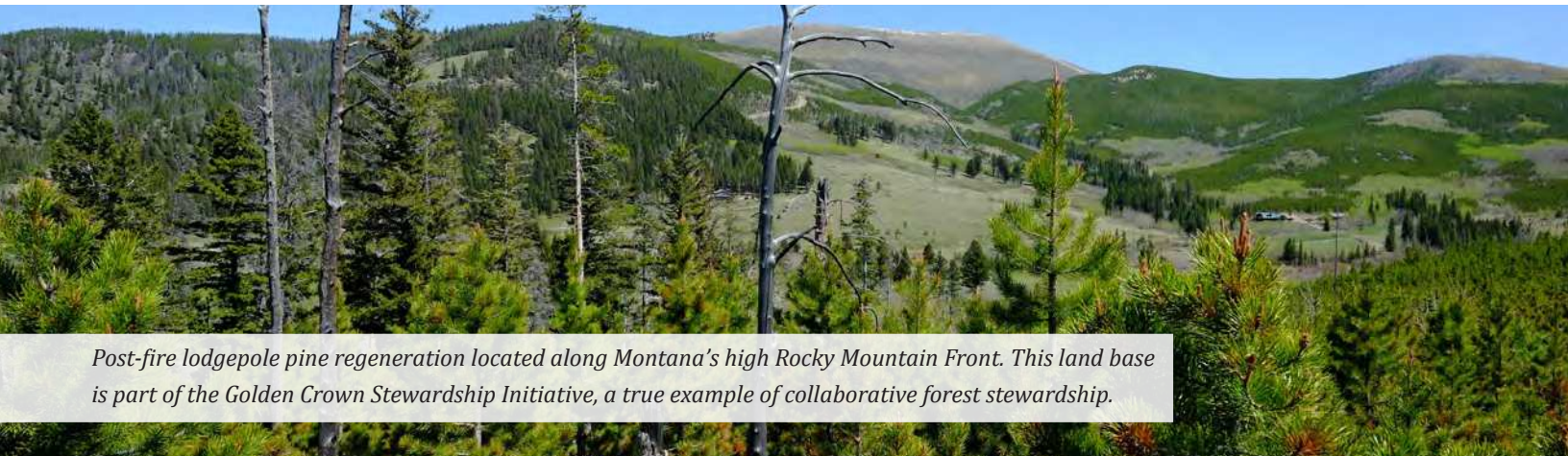
Post-fire lodgepole pine regeneration located along Montana’s high Rocky Mountain Front. This land base is part of the Golden Crown Stewardship Initiative, a true example of collaborative forest stewardship.

Recently, DNRC has partnered with the American Forest Foundation (AFF) to pilot a “targeted marketing” approach to increase acres treated on private forest lands – specifically with landowners within watersheds of critical importance to adjacent communities who may not be accustomed to