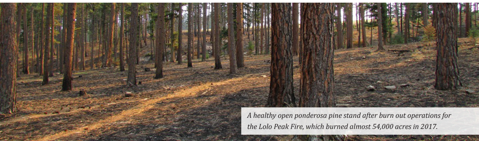
A healthy open ponderosa pine stand after burn out operations for the Lolo Peak Fire, which burned almost 54,000 acres in 2017.