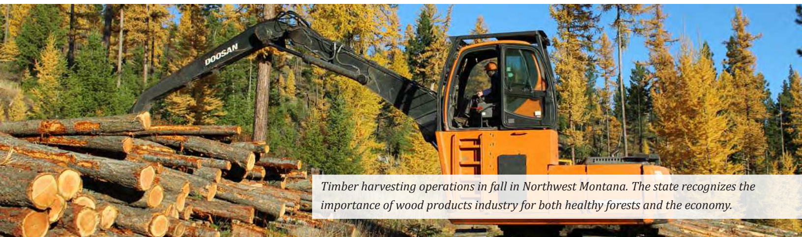
Timber harvesting operations in fall in Northwest Montana. The state recognizes the importance of wood products industry for both healthy forests and the economy.