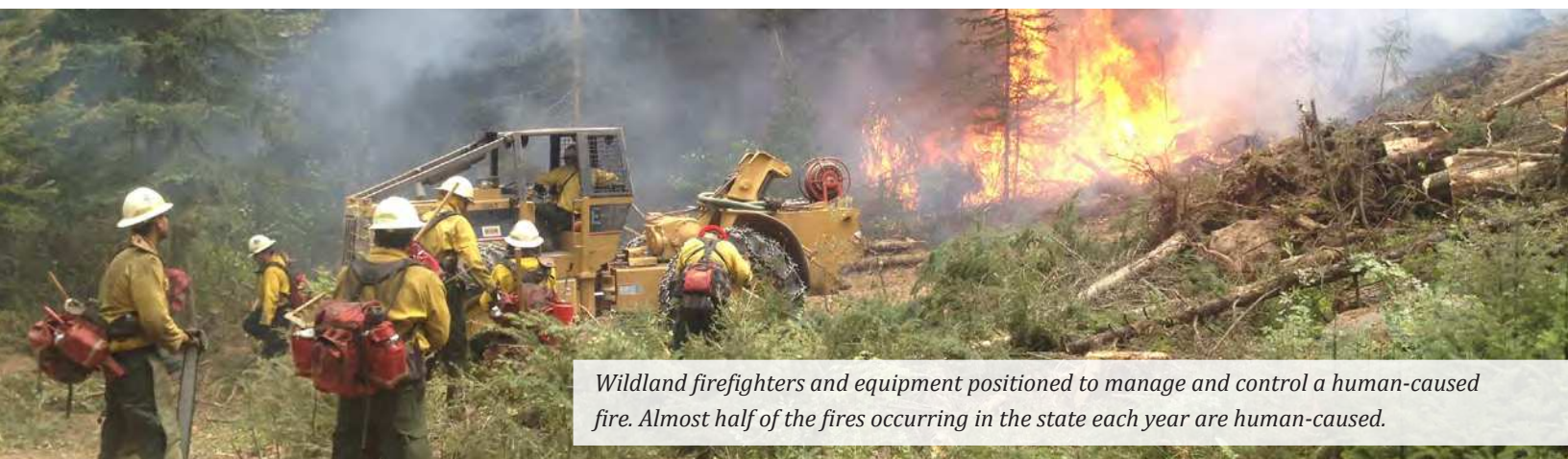
Wildland firefighters and equipment positioned to manage and control a human-caused fire. Almost half of the fires occurring in the state each year are human-caused.

The Smith Shields project was developed under the forest health categorical exclusion authority granted in the 2014 Farm Bill and is designed to significantly reduce fuel loading by treating 1,660 acres all within the wildland urban interface and improve the ingress and egress from the Smith Creek Community. It straddles the Park County - Meagher County line and is strategically located in areas identified by the counties as in need of treatment to protect the health and welfare of their citizens including their volunteer fire fighters. The project is particularly important to the Smith Creek Community which is immediately adjacent to portions of the project. Many of the landowners in Smith Creek have reduced forest fuels on their private property and the work allowed them to be recognized as a Firewise Community. The project has the support of the Custer Gallatin working group and Park and Meagher Counties which have all also supported the project in District Court and the Ninth Circuit Court of Appeals. This relatively small project will remove dead, downed and dying trees in the wildland urban interface. It is exactly the kind of project that needs to be done to foster fire-adapted communities. For all of the reasons listed above, DNRC invested resources in the Smith Shields Project with an Amicus Brief and a declaration from the State Forester and intends to continue this investment in future court proceedings.